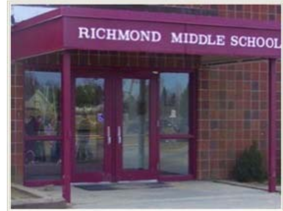
RICHMOND MIDDLE SCHOOL

Richmond Middle School is a small, friendly school housed in the same physical plant as the high school, with a designated wing for our 6 th , 7 th and 8 th graders. The students and staff both agree that the size of the school adds to its academic success, repeatedly making AYP. The eight home base teachers along with the four shared teachers of art, music and PE/health, provide our students with a good learning environment, that's fun, interesting and a safe place where everyone knows your name and learning needs.