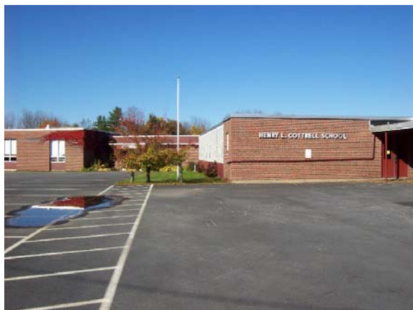
HENRY L. COTTELL SCHOOL, MONMOUTH

The Cottrell School is located in Monmouth, Maine. In 2006, we celebrated our 50 th anniversary. At that time we shared with the community our pride in our school and history. Our student population has remained relatively stable at about 215 children. Our average class size is about fifteen, with three full time kindergartens, three first grade-looping classes, three-second grade looping classrooms and three third grades. We also offer reading and math support through Title 1 and special education services. Our children have art, music, library and physical education each week. This year we have included a four-year-old program into our school as part of collaboration with Head Start.