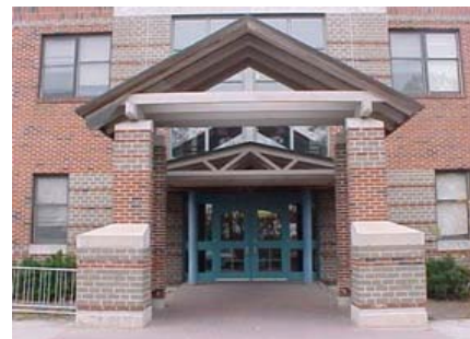
HALL-DALE MIDDLE SCHOOL

We look forward to a successful school year as this collaboration grows through the opening transition year.