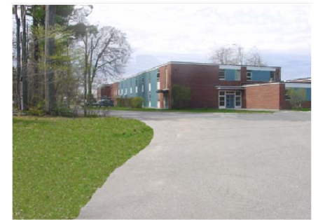
HALL-DALE HIGH SCHOOL