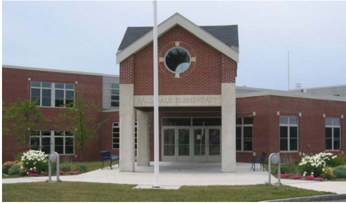
HALL-DALE ELEMENTARY SCHOOL

Respect, responsibility, and honesty are our value words that guide students and staff at Hall-Dale Elementary School.