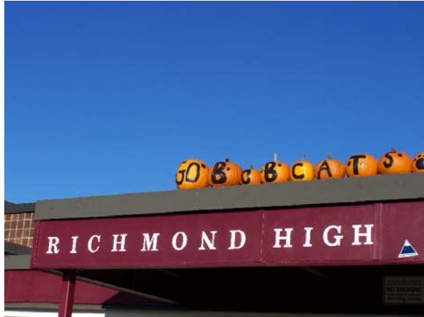
RICHMOND HIGH SCHOOL

Richmond High School is a NEASC accredited high school for students in grades 9-12, located on the banks of the Kennebec River, just off Interstate 295 about half way between Brunswick and the state capital -Augusta. The staff, students and community are committed to providing a comprehensive education to all students where no one is left behind. Education is personalized, where students who need help, are provided with the resources to meet the standards and beyond.